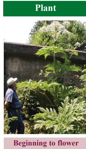
Beginning to flower

Branch County Calhoun County Gogebic County Ingham County Jackson County Kalamazoo County Kent County Manistee County Oakland County Ottawa County Saginaw County